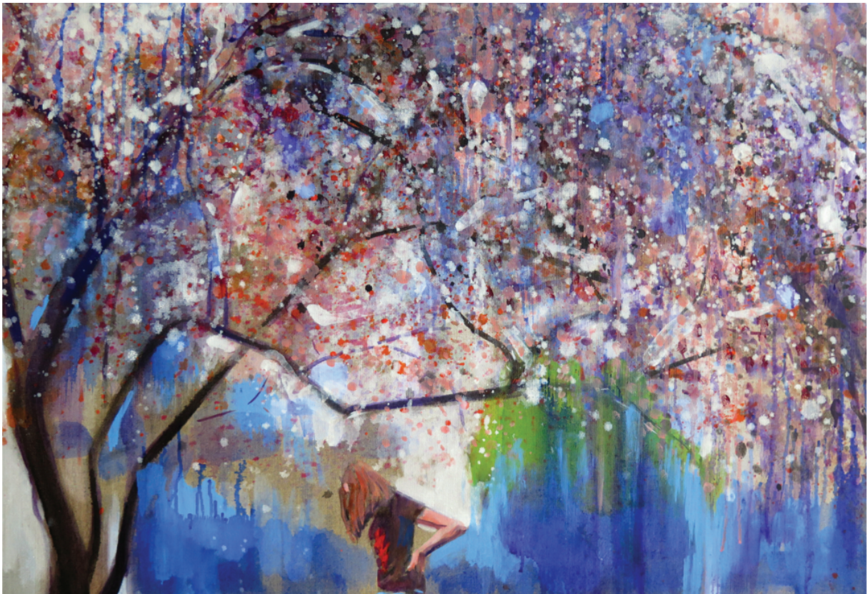
"Action - Constellation" detail - 2017 - oil/linen