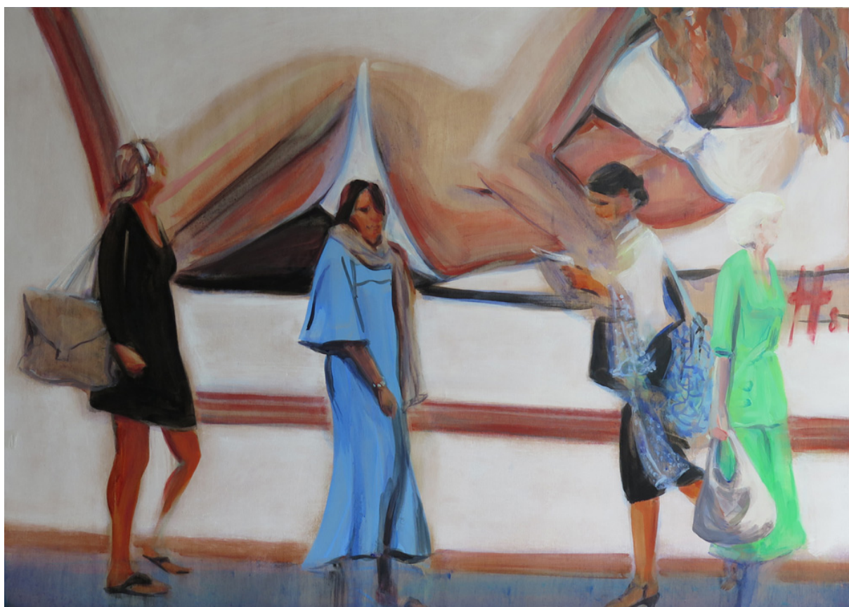
"CatWalk" 2017 - oil/wood - 80x100cm